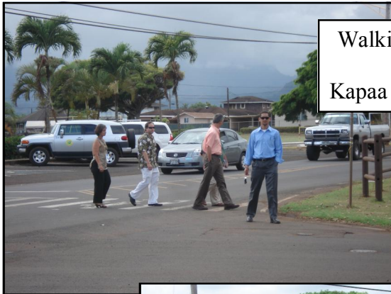
Walking across Kawaihau Road by Hauaala Road near Kapaa Elementary and High Schools