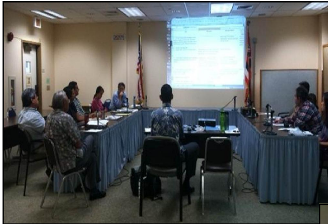
Working on development standards (CZO) with Planning and Public Works.