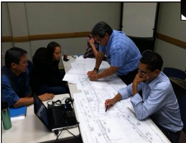
An Engineer's "dream come true!"