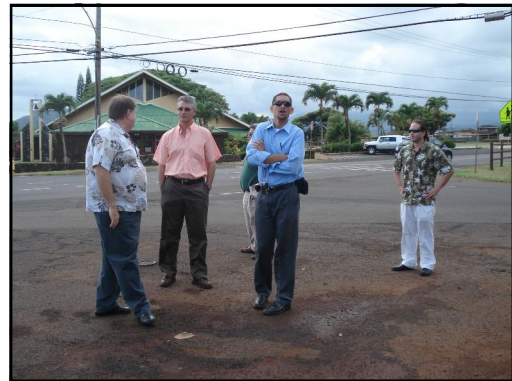
Assessing and discussing possible improvements for the Kawaihau/Hauaala Road intersection and making a safe route to walk to Kapaa Elementary and High Schools