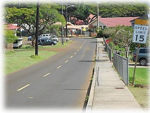
Pictured above: Maka Rd to Kalaheo school