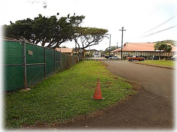
Pictured above: Maka Rd in front of Kalaheo school