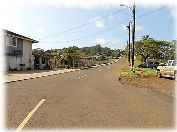
Pictured above: Maka Rd to Papalina