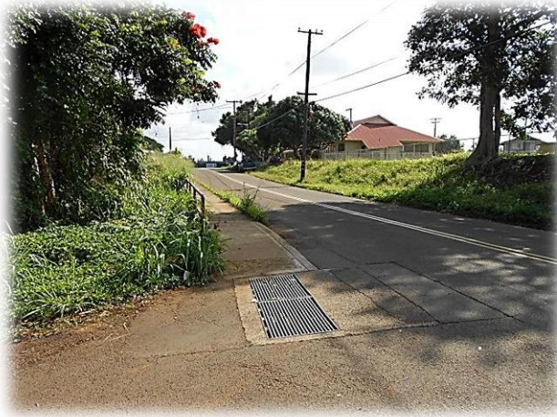
Pictured above: Hokua/Puu intersection